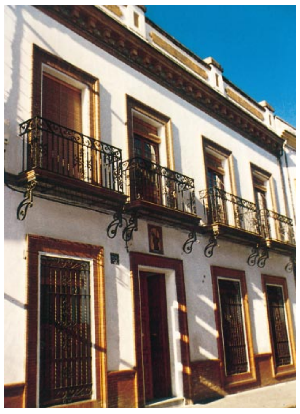
Front of the native house of Mother Trinidad.