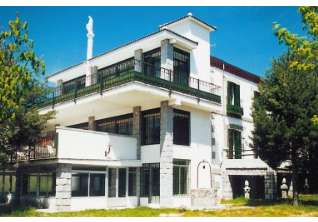
This view illustrates one of the houses of the summer complex at Navalperal de Pinares (Avila), where the members of The Work of the Church enjoy their holidays in family environment.

«I already know of Fountain, of Life, of Love...Because, placed at the mouth of your divine begetting, I learnt this knowledge so profound of your eternal begetting; and I saw how, in springs of being, the Word emerged in loving response of your eternal saying. And there, in the loving embrace of the Holy Spirit, I satiated in You forever. But a satiety that opened in me such capacity, that now only will be filled when your glory eternally appears». (from "La Iglesia y su misterio", The Church and her mystery, pg. 97)