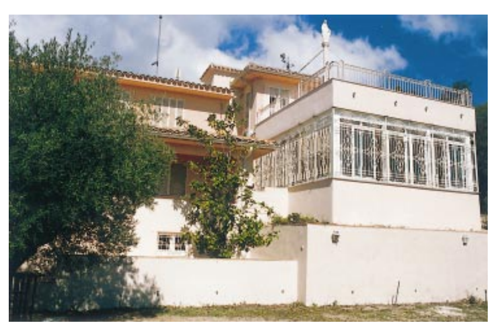
A house dedicated to the apostolic activity with young people and children in the hills of El Escorial (Madrid).

«The Work of the Church... comes for everyone and to bring up to date, in the warmth of the infinite Wisdom, the warm and living presentation of our very rich dogma. It comes to bring the warm theology, warmed up in love, showing the sparkling face of God, who manifests Himself in the splendorous face of the Great Christ of all ages.