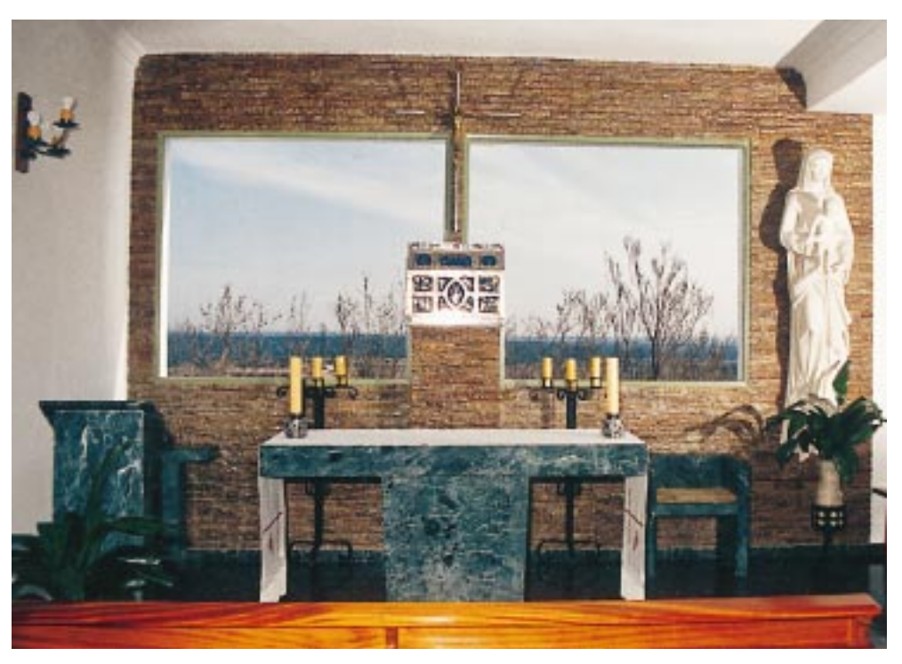
Chapel of the Apostolate House of Pinar de las Rozas (Madrid).

For although I know you are sad and in your members exiled, I also know that you are glorious in the Feast of Him whom you love.