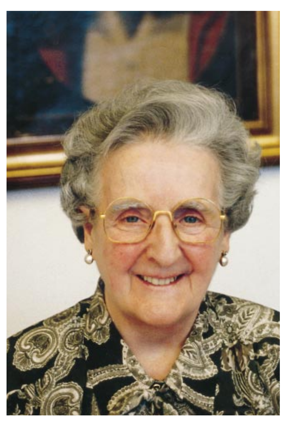
Mother Trinidad in 1998.