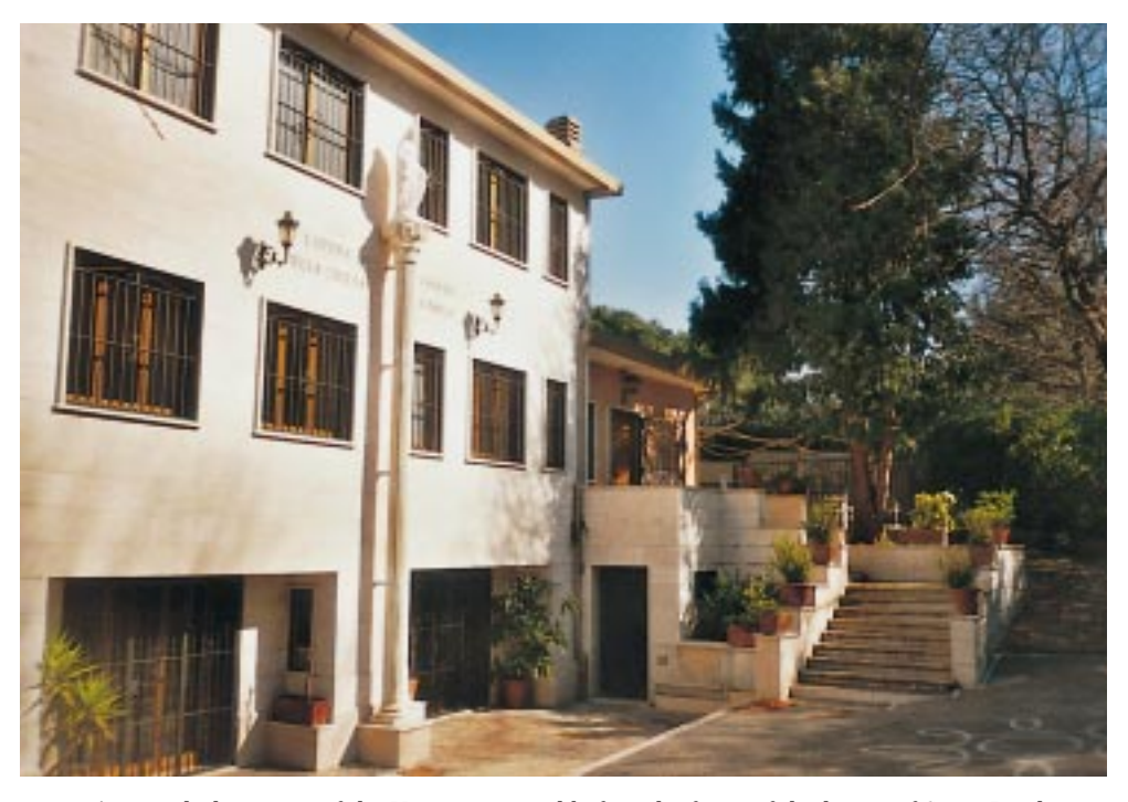
As usual, the statue of the Virgin is raised before the front of the house of Saint Paul at Rocca di Papa (Rome).

«58. [...] If to everything I have in my soul the Church were to say no, were it possible, I would tear out my soul, because before being soul I am Church. (18-4-59)».