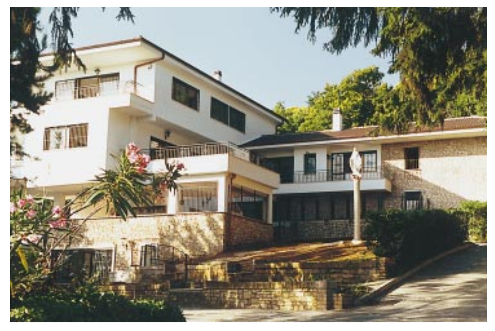
For its mission to stay always close to the Pope, The Work of the Church has searched a house very near to Castelgandolfo, a resting place of the Holy Father. The photo illustrates a view of the Villa.

which they love with all their being and for which they offer their lives, seeking only God's glory. In one word: " To be Church and to make everyone be Church ".