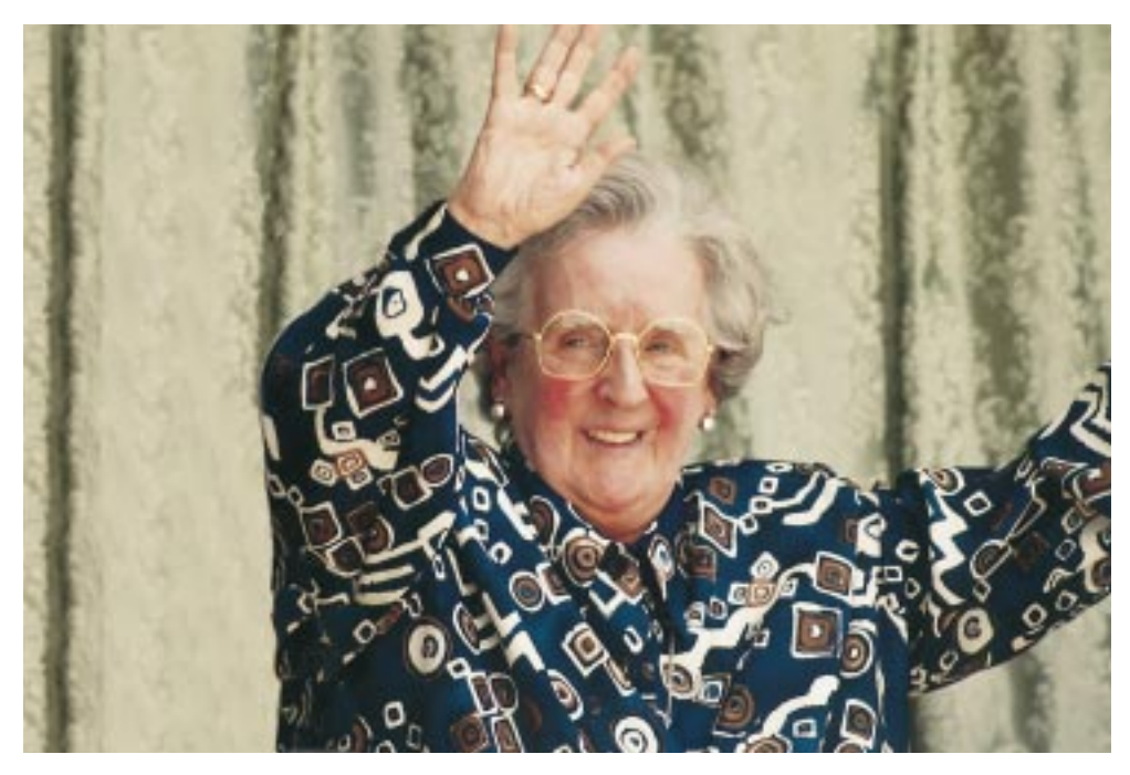
This same day while she greets a group of her spiritual children coming in a pilgrimage from Spain and Italy to celebrate the feast of the Holy Trinity close to her.