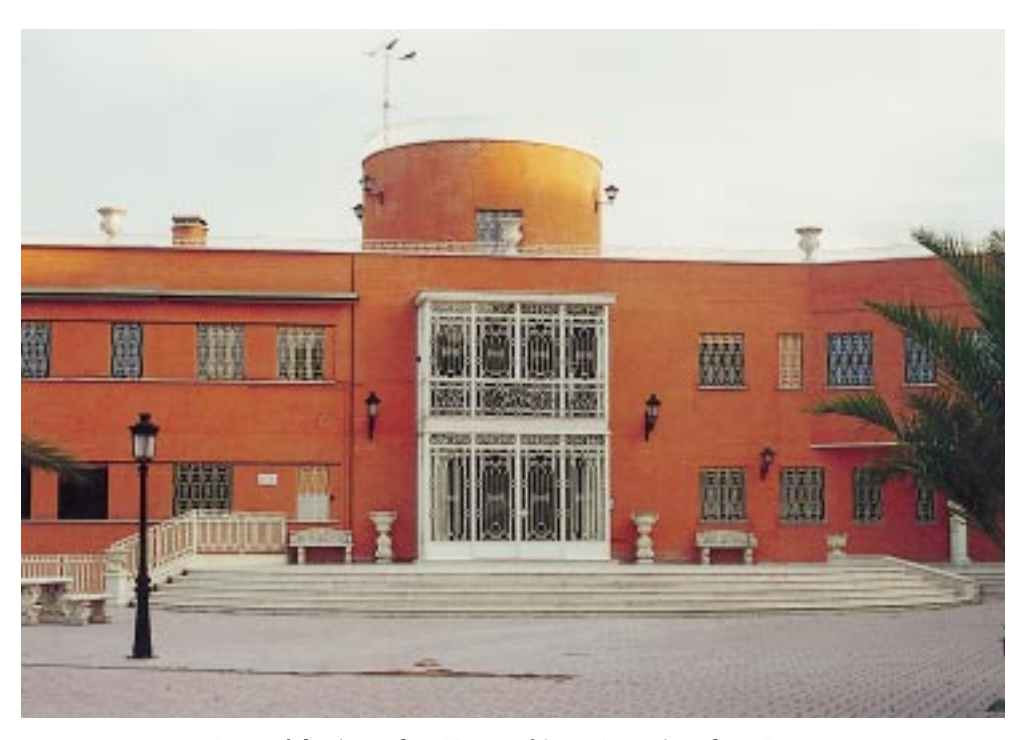
Front of the Apostolate House of Saint Peter Apostle in Rome.

On this day of the Most Holy Trinity, so moving and of so much gratitude to God, for having in our House of "Saint Peter the Apostle" such a significant number of the Successors of the Apostles; I wish to tell those who have come to share these days with La Obra de la Iglesia (The Work of the Church) in our Home, that we are full of joy.