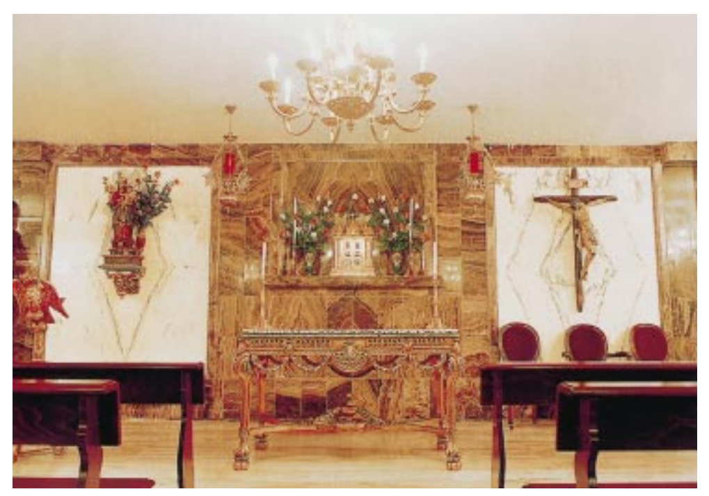
Chapel of the House of Saint Peter Apostle, one of the Apostolate Houses of The Work of the Church in Rome.

I offered myself to God as victim to glorify Him, helping the Church with all that, in order to carry it out, He had manifested and entrusted to me from the time of the Council; something that I have