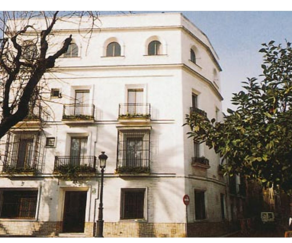
A view of the Apostolate House of The Work of the Church in Seville, in the typical and central "Plaza de Pilatos".